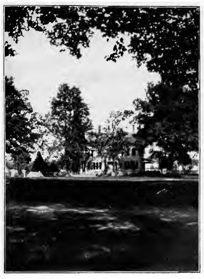
HOUSE WHERE SILL WAS BORN, WINDSOR, CONN., 1841